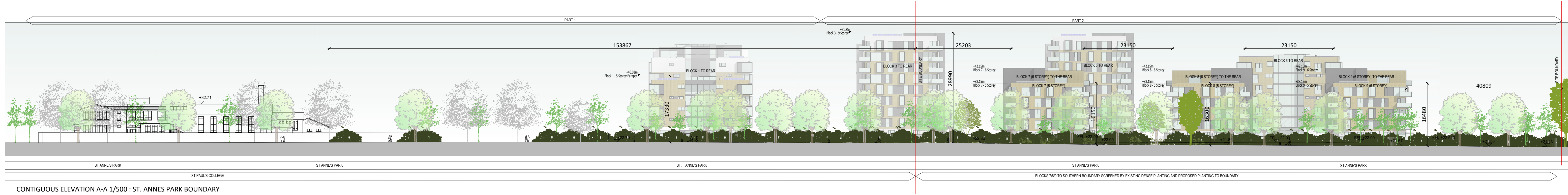
CONTIGUOUS ELEVATION A-A 1/500 : ST. ANNES PARK BOUNDARY