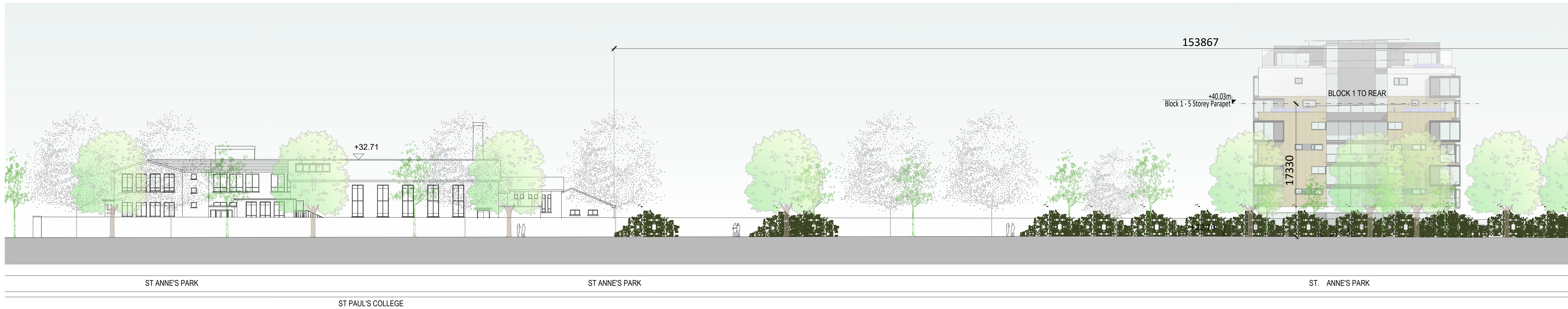
CONTIGUOUS ELEVATION A-A 1/500 : ST. ANNES PARK BOUNDARY